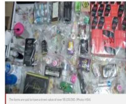
The items are said to have a street value of over $133,000.

SINGAPORE: The Health Sciences Authority (HSA) seized more than 39,000 units of illegal health products, including weight-loss products, sexual enhancement drugs and cosmetics during an operation against online retailers this month.